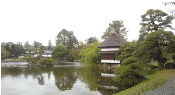
Shuraku-en Garden at Tsuyama, Northern Okayama.

Northern Okayama—known as the Mimasaka district or ‘beautiful forest’ in ancient Japan—is an area with an abundance of natural beauty and historic sites such as old castles and gardens. However, Northern Okayama is suffering from the effects of an aging and shrinking population, because young people have moved to study and work in big cities. Although the region does have natural resources and places of cultural heritage such as top-quality ‘Wagyu’ beef and timber from forests, these industries are not fully developed.