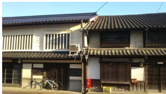
Historic Housing in Tsuyama City

With this background, Okayama University agreed to cooperate with 10 regional municipalities to support their activities in regenerating local communities.