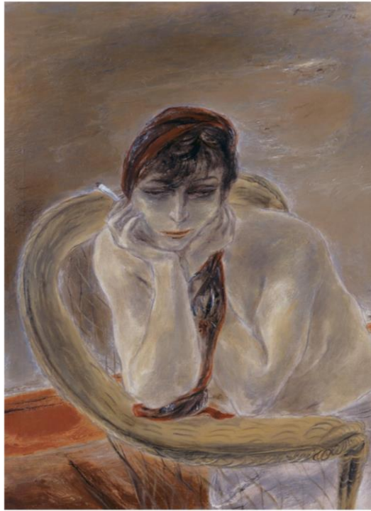
Girl Wearing Bandana, 1936, Oil on canvas, Fukutake Collection