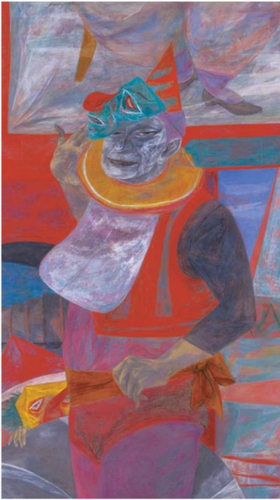
Mr. Ace, 1952, Oil on canvas, Fukutake Collection