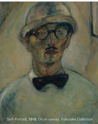
Self-Portrait, 1918, Oil on canvas, Fukutake Collection